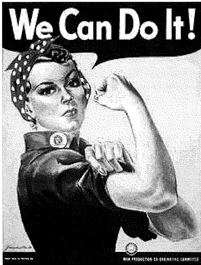
Westinghouse for the War Production Co-Ordinating Committee, c. 1943